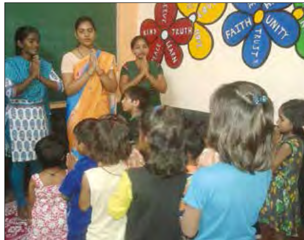
(IMPARTING VALUE EDUCATION)

Education includes all-round development of children. So, we include sessions on moral values in our holistic education programme. The rich culture and heritage of our country is revealed through moral stories and interactive activities. At SVK, we held moral sessions and motivational workshops to make students realize their true potential enhance their hidden talents and make right choice in life. Through value education, we strive to develop the social, moral, aesthetic and spiritual sides of children, which are often undermined in formal education.