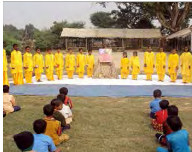
(REVIVING VEDIC CULTURE IN STUDENTS)

Regular sessions of Yoga and Meditation were held to improve concentration and mental ability of children. They also learnt recitation of Vedic Mantras to gain positive energy within.