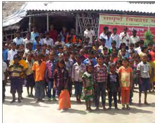
(STUDENTS OF BIHAR CENTRES)

Through SVKs, we work hard to strengthen the core foundation of children by taking enrichment classes for Hindi, English, Mathematics and Science, while using innovative learning techniques.