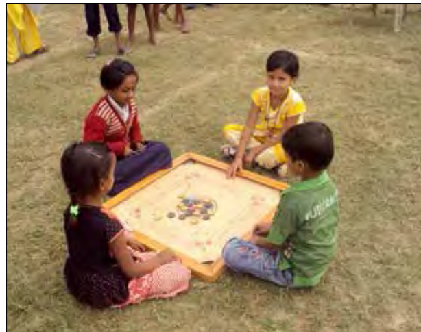
(STUDENTS PARTICIPATING IN DIFFERENT GAMES)

Life skill education is an important vehicle to equip young people to negotiate and mediate challenges and risks in their lives, and to enable productive participation in society. At SVKs, we provide life skill training and engage students in activities where they know how to manage their time effectively and how to enhance learning power.