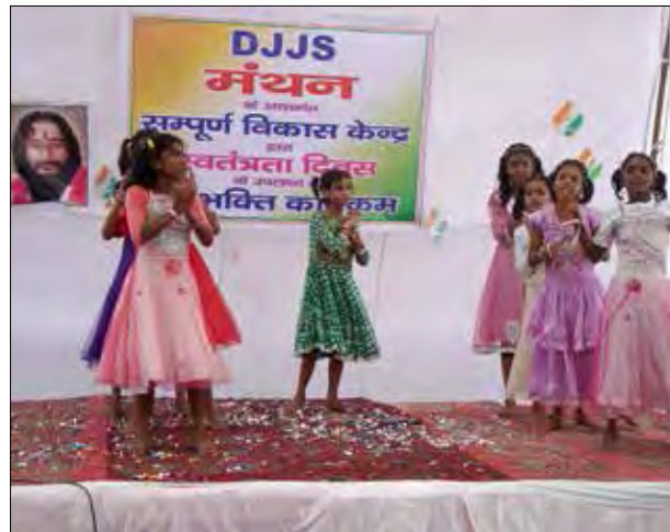
(MANTHAN-SVK STUDENTS PARTICIPATING IN EVENTS)

Regular health camps were organised to ensure good health of all children. During the camps, children, parents and community are educated on personal health and hygiene. Periodic health checkups, needful medication as well as nutritive supplements were also provided to the children on regular basis.