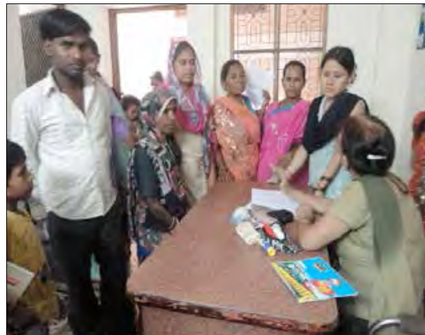
(MANTHAN-SVK STUDENTS PARTICIPATING IN EVENTS)

Uniform and Stationery material like pen, pencil, register etc., were given away to students on need basis as and when required.