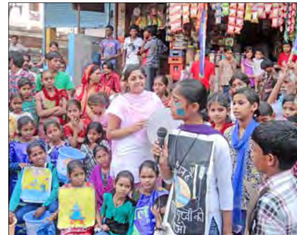
(ACTIVITIES DURING WATER RALLY)

Students undertook a rally to generate community awareness to save water through skit, speech and street plays.